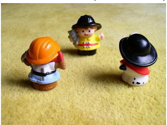
I want both of you to...

This style is used when leaders tell their employees what they want done and how they want it accomplished, without getting the advice of their followers. Some of the appropriate conditions to use it is when you have all the information to solve the problem, you are short on time, and your employees are well motivated.