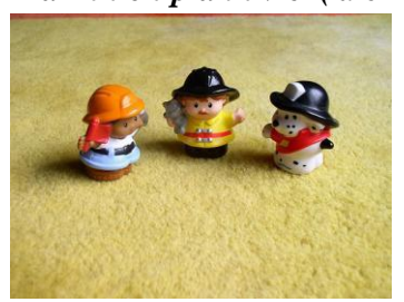
Let's work together to solve this...

This style involves the leader including one or more employees in the decision making process (determining what to do and how to do it). However, the leader maintains the final decision making authority. Using this style is not a sign of weakness, rather it is a sign of strength that your employees will respect.